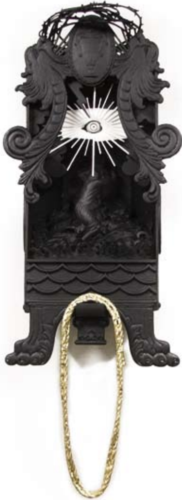
Rock of Ages (2010) *