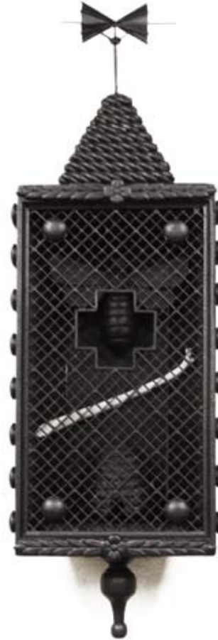
The Sacrifice of One for Many – Calling All Queens (2010) *