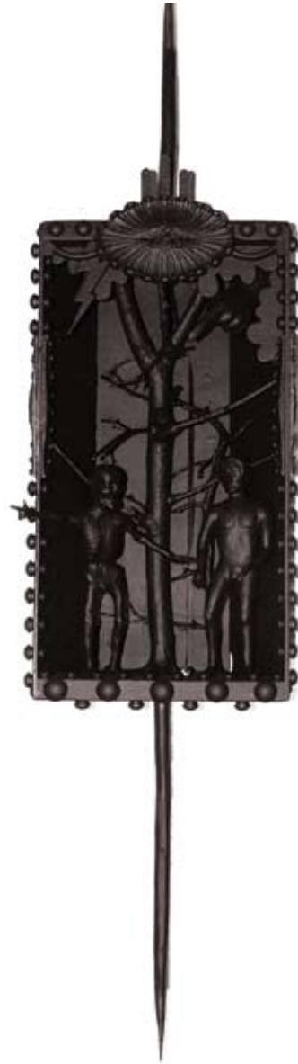
The Consequence of Conscience I – The Expulsion of Adam (2010) *

(*for materials and size please look at the first picture)