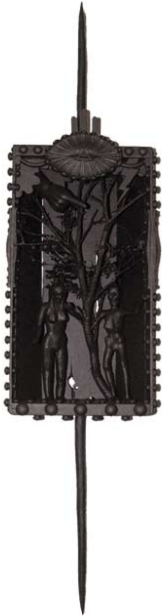
The Consequence of Conscience II – The Expulsion of Eve (2010) *