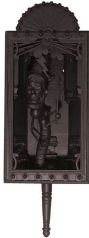
Abraham Lincoln Holds the Sword of Righteousness (2010) *