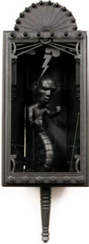
Liberation Through Divine Intervention (2010) *