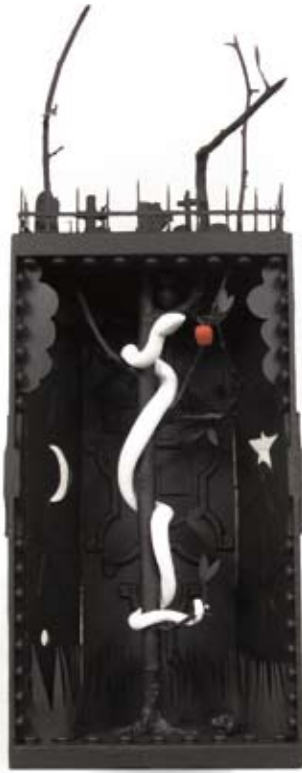
The Serpent Presents the Seed of Knowledge (2010) *

(*for materials and size please look at the first picture)