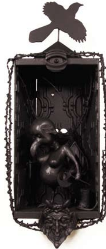
We Are All Worms.... (2010) *